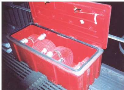
Above and on left: JBX 120-COR